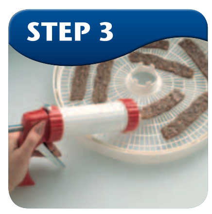
Unscrew red ring from end of white tube. Place meat mixture in tube. Insert desired tip into red ring and screw ring tightly back on tube.