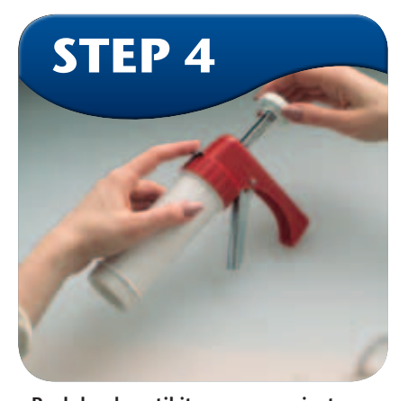
Push knob until it presses against meat. Hold jerky gun over Pet Treat Maker tray and squeeze trigger repeatedly to release mixture on to tray. Dry jerky at highest temperature (160° F) until jerky is "leathery." It will take 4 to 15 hours to dry. Occasionally pat jerky with paper towel to remove surface oil.