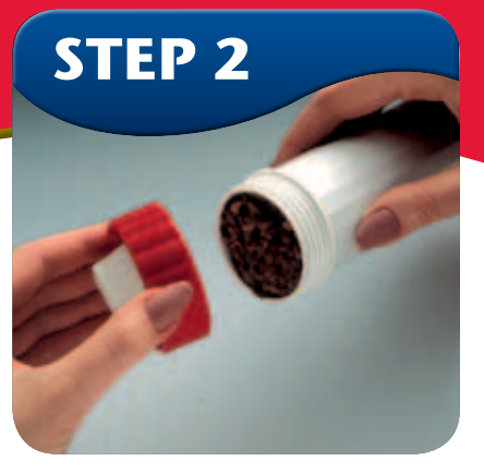
To load the gun with the jerky meat mixture, hold the silver tab down and pull the red knob all the way back.