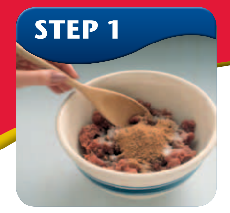
Blend one seasoning and cure packet of NESCO® Jerky Spices with one pound of extra lean ground beef.